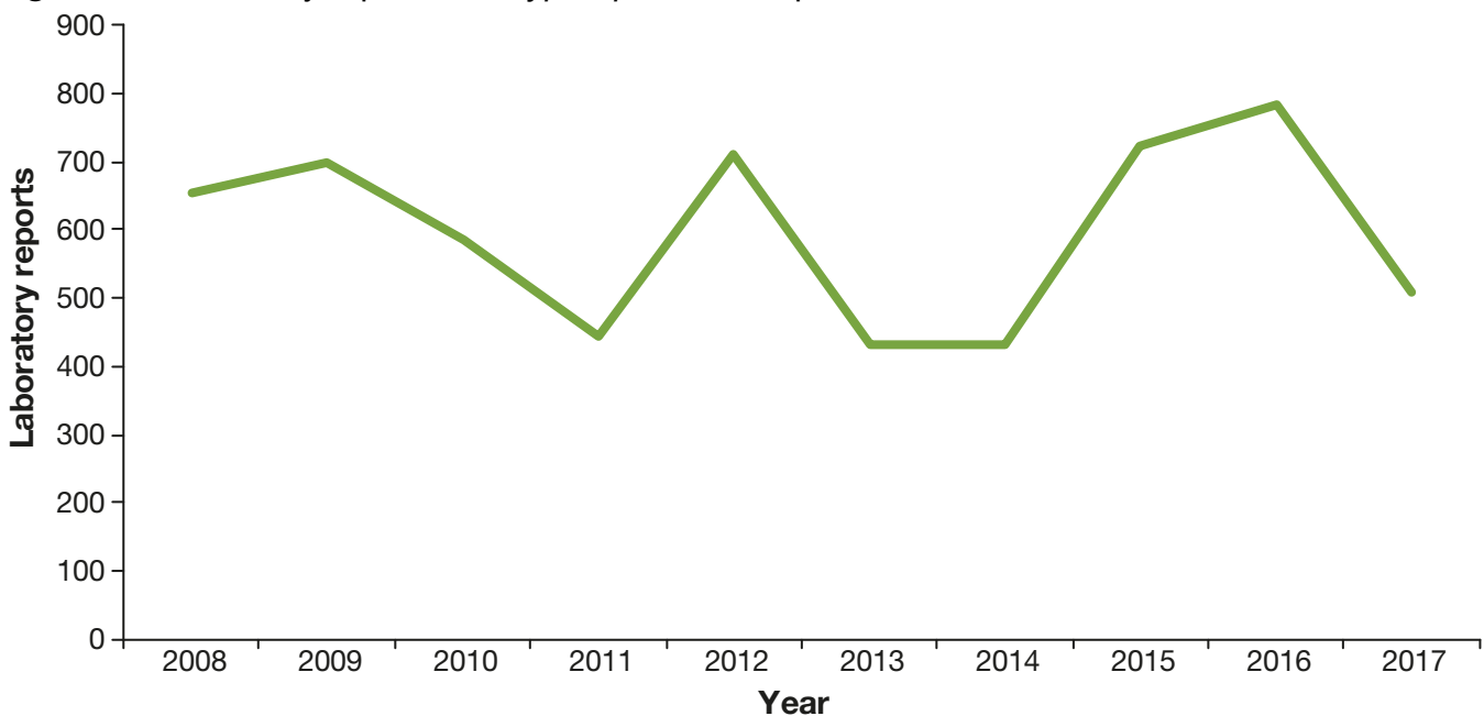
Figure 1: Laboratory reports of Cryptosporidium reported to HPS 2008-2017.

Since 2011, a proportion of all isolates are speciated each year by the Scottish Parasite Diagnostic and Reference Laboratory, in addition to any isolates thought to be associated with an incident or outbreak. Of the 509 reports of Cryptosporidium in 2017, 224 (44%) were speciated, and 138 (61.6%) were identified as Cryptosporidium parvum and 84 (37.5%) as Cryptosporidium hominis . This is slightly higher proportion of C. parvum and correspondingly lower proportion of C. hominis than the proportions in 2016 of 53% and 47% respectively, but the proportions in 2017 were very similar to those in 2014 and 2015 of approximately 60% and 40% respectively.